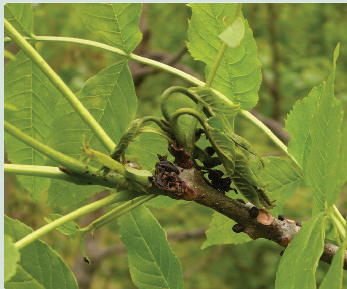
An ash tree infected with Chalara fraxinea , sometimes known as Hymenoscyphus pseudoalbidus (which describes another life stage).

Ash dieback is a disease of ash trees caused by the fungus Chalara fraxinea . The disease causes leaf loss and crown dieback in affected trees and often leads to tree death. Ash trees showing symptoms of Chalara fraxinea are now widespread across Europe and in 2012 it was detected for the first time in Britain – initially in a consignment of infected trees sent from the Netherlands to a nursery in the south of England, but later in trees planted in the natural environment. Surveys have now confirmed the presence of ash dieback disease at more than 150 locations in England and Scotland, including established woodlands. Chalara fraxinea is being treated as a quarantine pest under national emergency measures; it is important that suspected cases of the disease are reported.